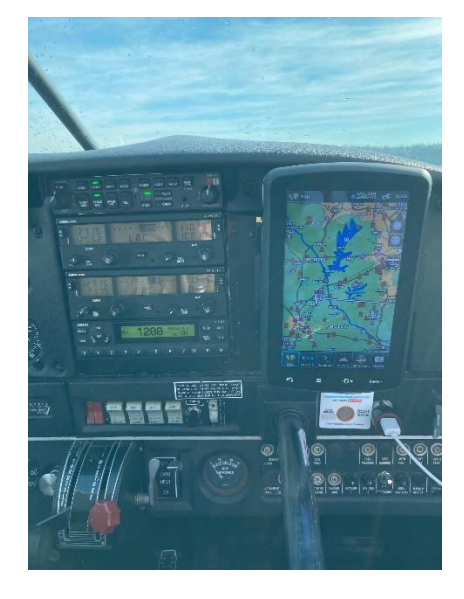
Next on the big news list is that we have added a Cessna 172L to replace our previous 172XP

Our first big news is a huge instrument panel upgrade for N515DH. It now has new radios, intercom, ADS-b and Garmin GPS. Vastly different from the last time you saw it. You really need to try it out. You will think it is a different airplane. Here is a small photo.